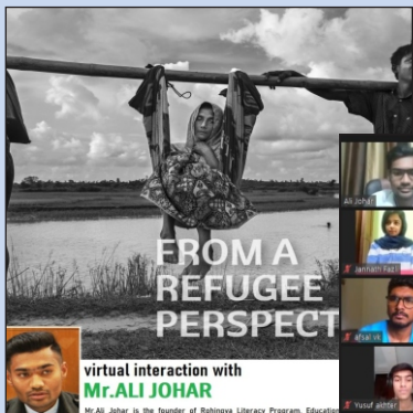
World Refugee Day